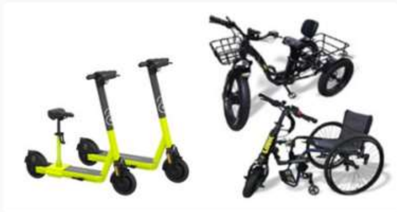
Superpedestrian continues to offer accessibility vehicles